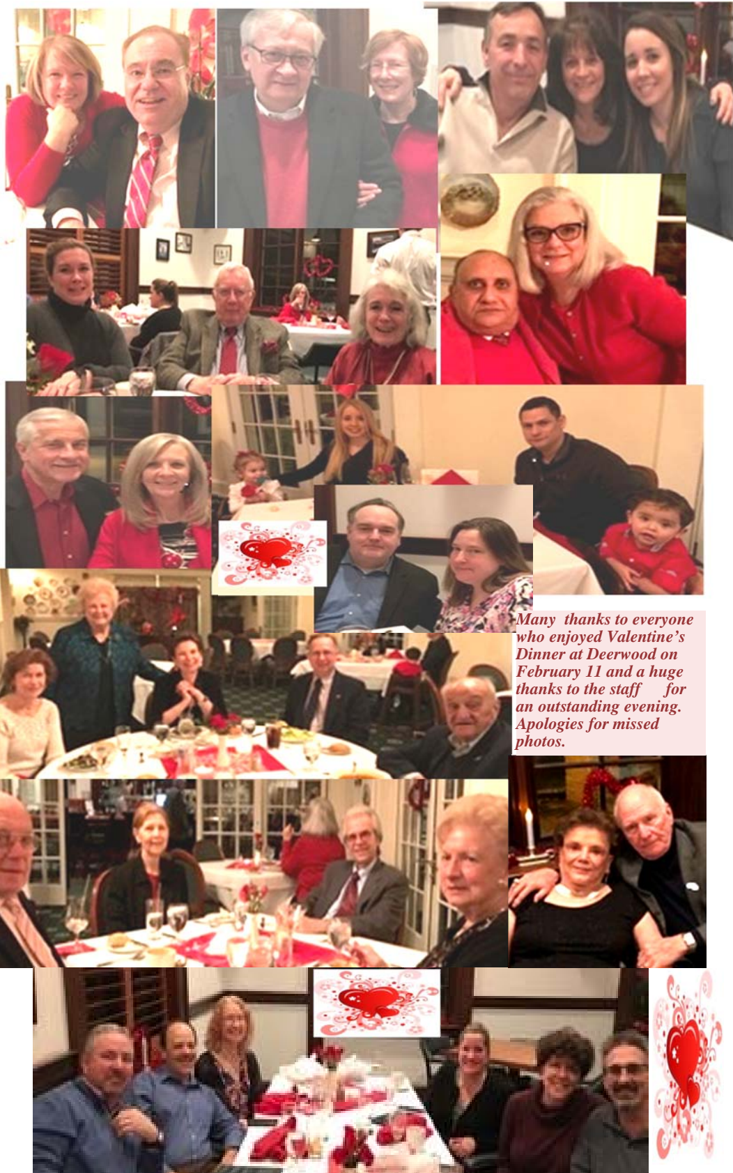
Many thanks to everyone who enjoyed Valentine’s Dinner at Deerwood on February 11 and a huge thanks to the staff for an outstanding evening. Apologies for missed photos.

LUNCH 11– 3 Tuesday & Wednesday 11-6 Thursday, Friday, Saturday 11-4 Sunday *** DINNER THURSDAY, FRIDAY AND SATURDAY EVENINGS SEATING 6 TO 9 PM Delicious Food .....Fine Wine and Beer!